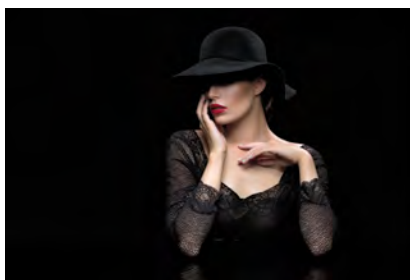
DMB Ink Savings: 32%