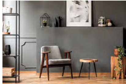
DMB Ink Savings: 37%