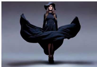
DMB Ink Savings: 29%