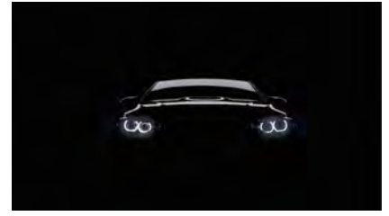
MTIU Ink Savings: 44%