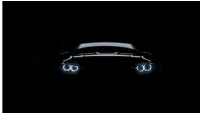
DMB Ink Savings: 27%