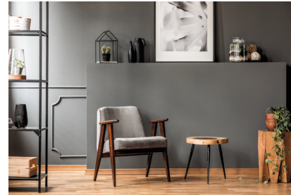
DMB Ink Savings: 37%