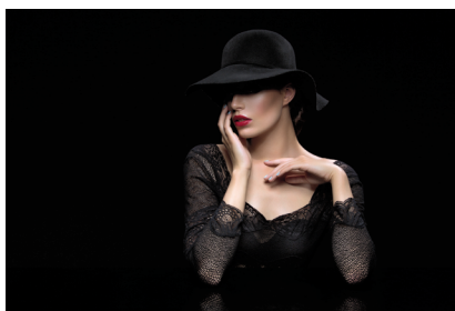
DMB Ink Savings: 32%