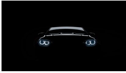
DMB Ink Savings: 27%