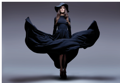
DMB Ink Savings: 29%