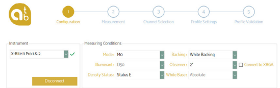
Step-by-step operating mode available in Alwan ToolBox

In our latest Alwan ToolBox product, we have decided to simplify the profile creation process, building a step-by-step operating mode.